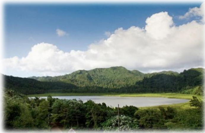
Grand Etang Lake