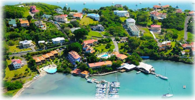
True Blue Bay Resort